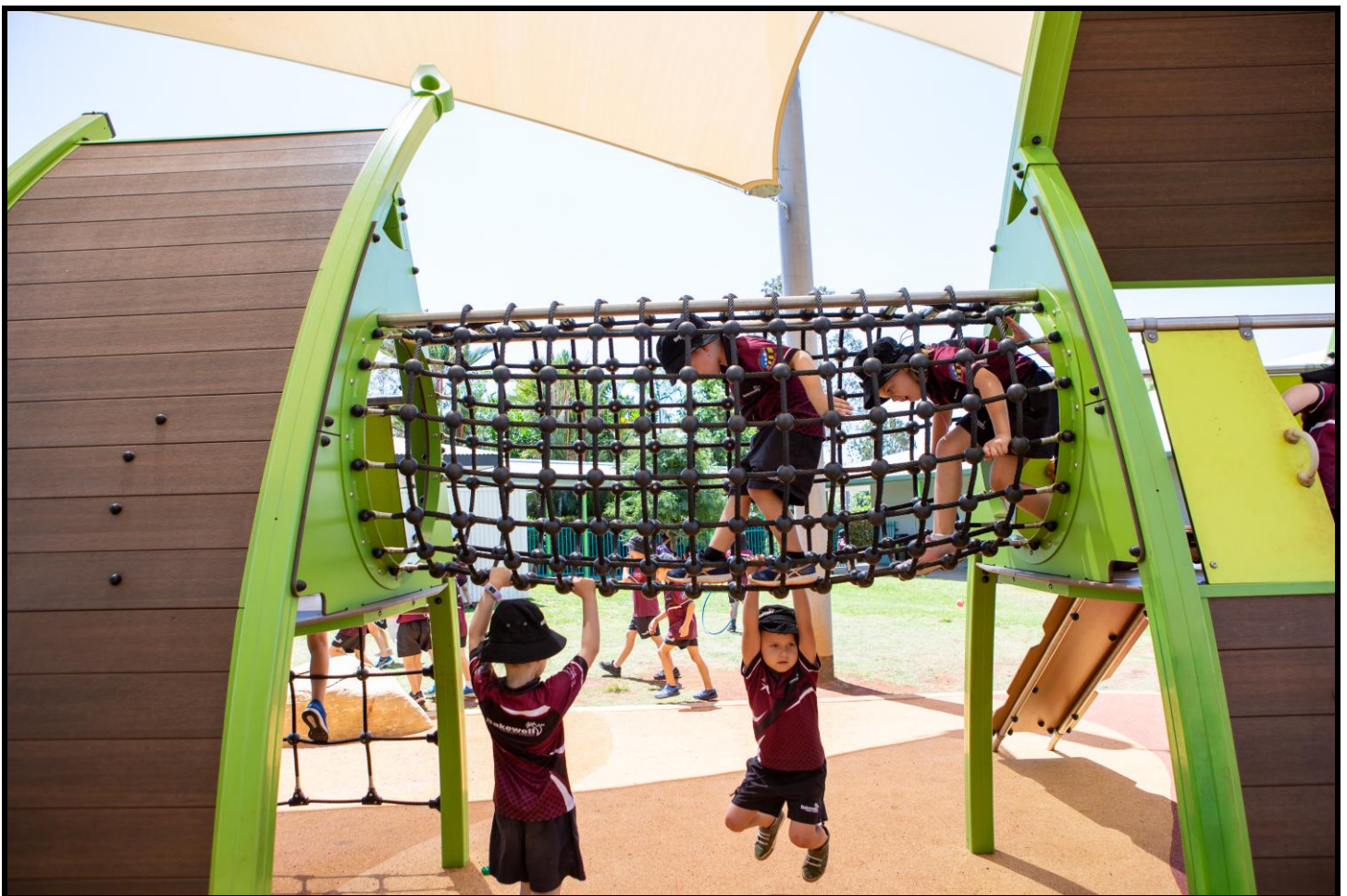
Figure 1 Early Years playground

In 2020 Bakewell Primary School implemented a COVID-19 Management Plan to ensure cleaning requirements were in place to support a safe school environment during the Pandemic. School cleaning resources were increased to accommodate this need.