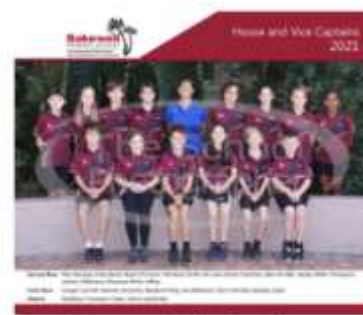
House and Vice Captains

The photo prices are: $18.00 each, 2 for $34.00, 3 for $46.00, 4 for $58.00 or 5 for $70.00. Any additional photos are $10.00 each. This discount is only available per family order.